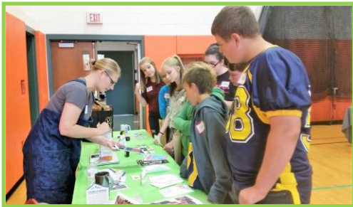
Career Day Meeting