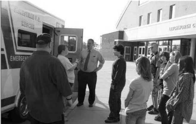
Volunteers from the Gainesville Fire Department explain to the middle school students at the Letchworth Health Expo some of the important things an EMT must know.