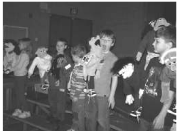
Students from Perry Elementary School get a chance to play with the Rural AHEC puppets after a presentation of The "Great Hospital Adventure".